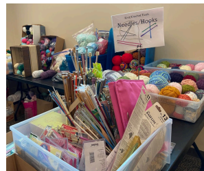
Top: Patrons on the hunt at a used book sale. Left: Knitting supplies at a craft event.